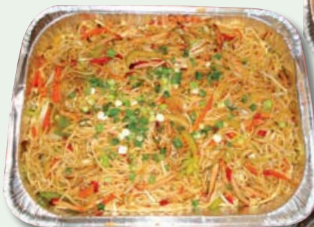
Pork Lo Mein