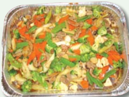
Sauteed Vegetable Beef