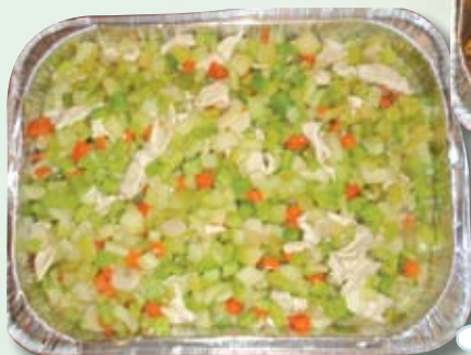
Almond Chick Chow Mein