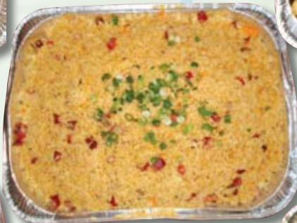
Pork Fried Rice