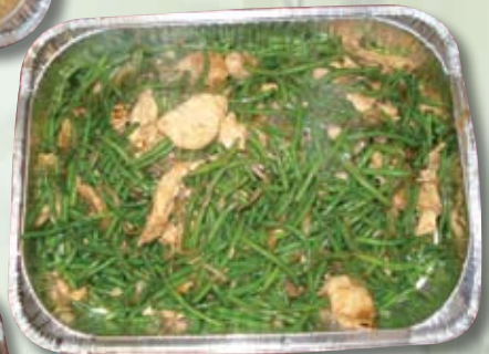
Green Bean Chicken