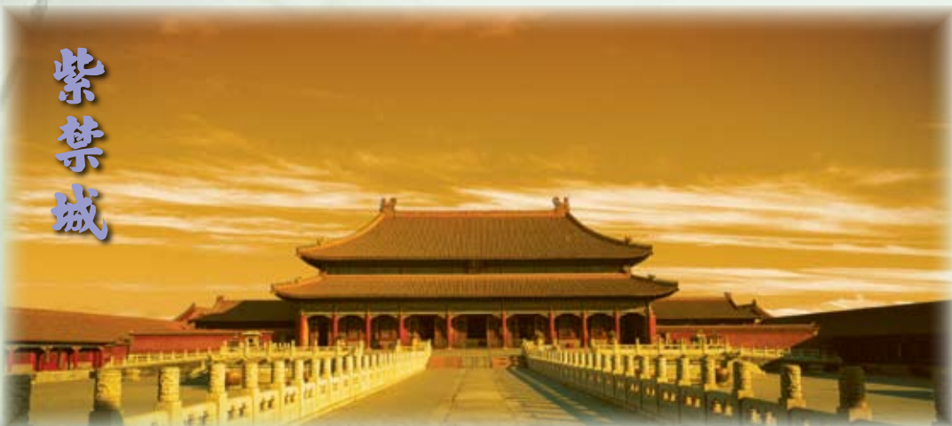
Beijing - The Forbidden City